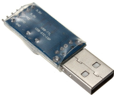
USB To RS232 TTL with PL2303HX Auto Converter Module Converter Adapter WIN7 Modul

Molex PicoBlade™ 1.25mm Pitch Connector, four pins